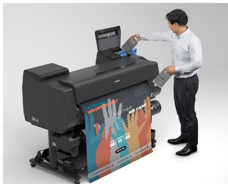
The imagePROGRAF GP-4600S shown with optional multifunction roll unit.